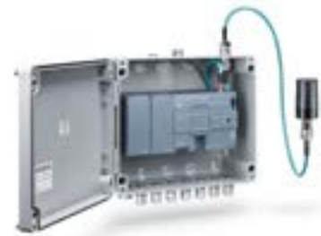
SIMATIC RTU3030C makes it possible to measure level measurement anywhere in the world while providing all the data in your centralized control center.

That's where a special feature such as what is seen with Siemens' ultrasonic controllers can make a big difference to reduce operating costs. The SITRANS LUT430 (Level, Volume, Pump and Flow Controller) and the SITRANS LUT440 (High-Accuracy Open Channel Monitor) both offer a full suite of advanced controls so that in normal operation, the controller will turn pumps on once water reaches the high-level set point, and then begin to pump down toward the low-level set point.