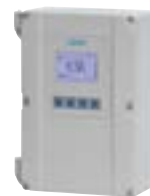
Siemens selection of products provide low cost of ownership when considering the entire product lifespan.

It's also important to consider the impact of Energy costs to determine the true operating cost of an instrument. Countries including Canada, UK, Germany, South Africa and Australia have different rates according to the time of day or season energy is consumed. It could cost up to 80 per cent more in peak periods compared to low periods. Since the instrument needs to run at all times, the high-cost periods are unavoidable.