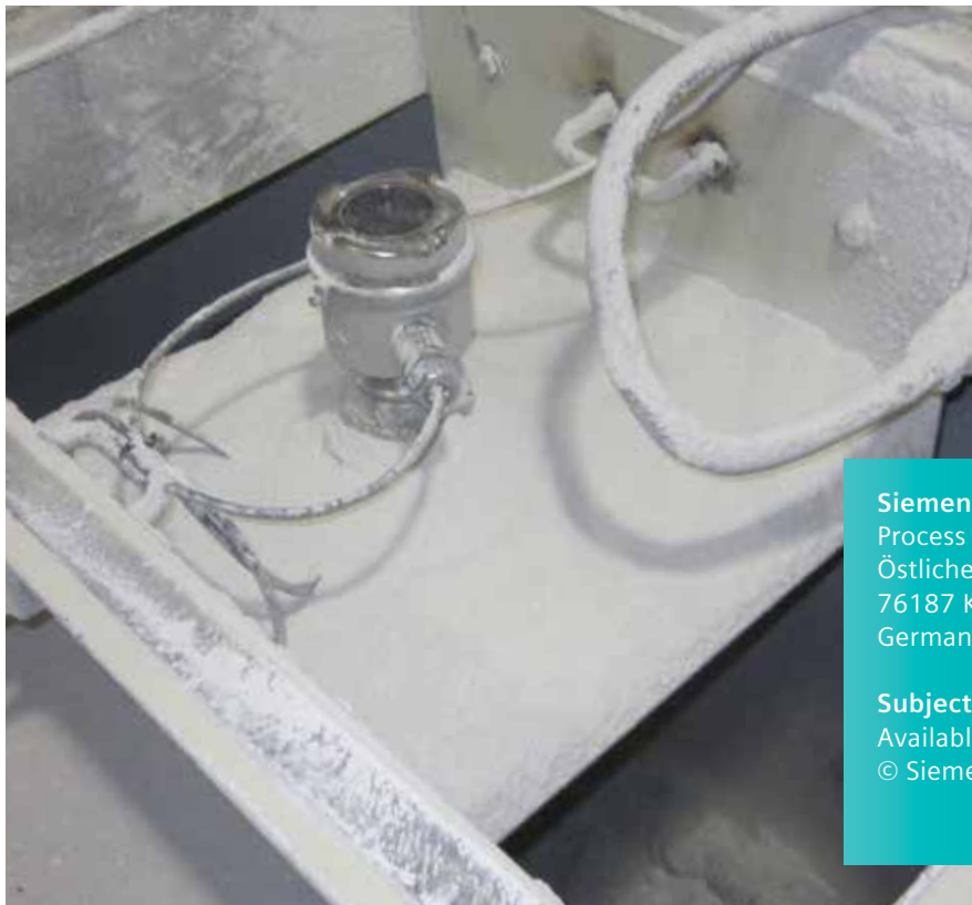
SITRANS LR560's highly durable polyetheramide lens antenna (left) can tolerate significant buildup, such as kiln dust

From reducing the waste stream of materials headed to landfills to ensuring environmental regulations are being closely followed, Siemens' wide portfolio of instruments are the eyes and ears of the cement plant. Kiln dust's second life is guaranteed by the precise monitoring of devices that reliably operate in this rugged environment.