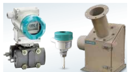
Key products in the kiln dust process.