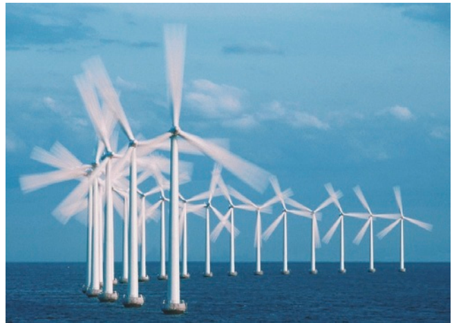
Other coastal use cases where virtual emergency medical assistance can be employed include offshore wind farms

Making the telemedical emergency system usable for this special case is the result of a close collaboration by multiple institutions and companies. GHC supplied the telemedical technology, while Siemens delivered the directional radio components used on ferries, rescue ships, offshore platforms, and the onshore stations. The planning and implementation of the communication infrastructure was the responsibility of the Siemens Solution Partner Wireless Consulting.